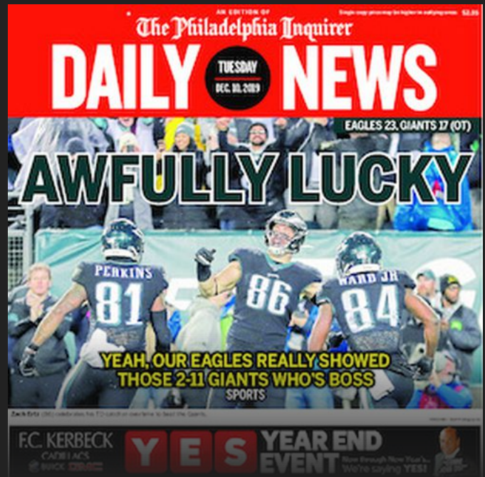
THE DAILY NEWS