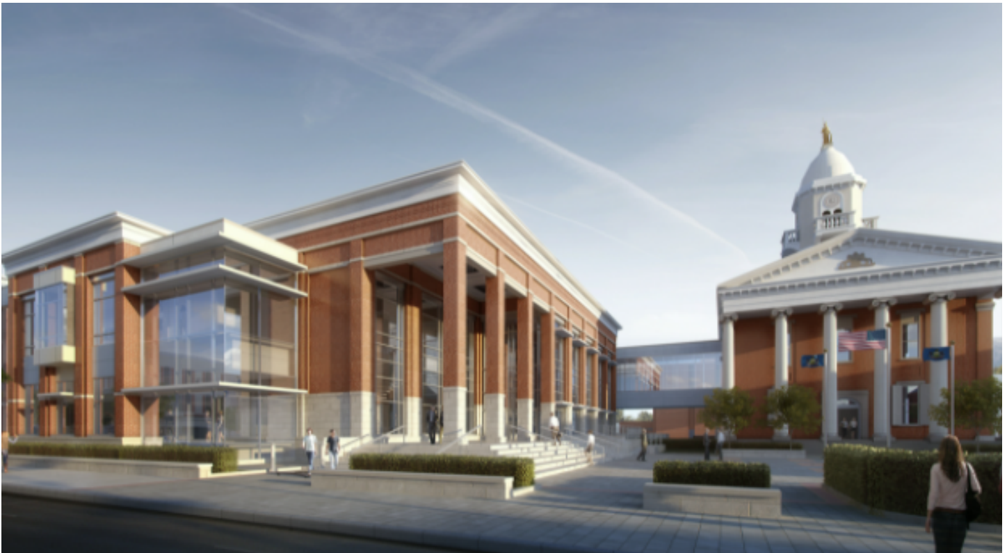
Artist rendering of Franklin County Judicial Center and Courthouse