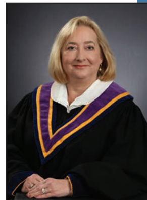
Justice Debra Todd