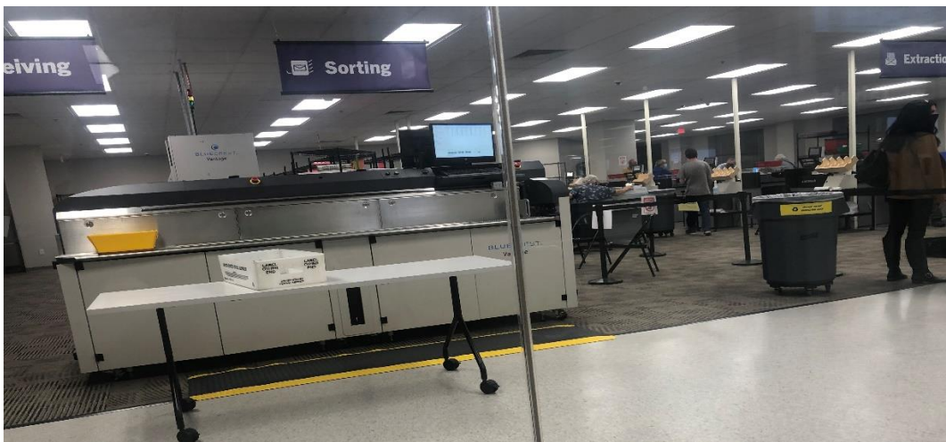
Figure 4 - The BlueCrest Sorting Machine Loading Tray section

14. I observed a counting room for ballots with counting machines. Trays of ballots came in through three doors that appeared to lead from a back office, a second back office supply room, and doors leading from an outside hallway with separate elevator access from the public elevators and the garage loading dock elevators.