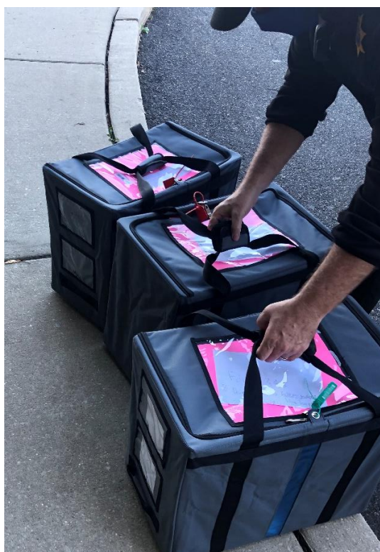
Figure 7 – Presumed Cartridges, USB, Paper Tape from scanner, properly sealed with green lock tie, being brought into building on THURSDAY morning by Sheriff, having been allegedly returned to the warehouse WEDNESDAY morning. They were opened without observers in off limits sequestered area