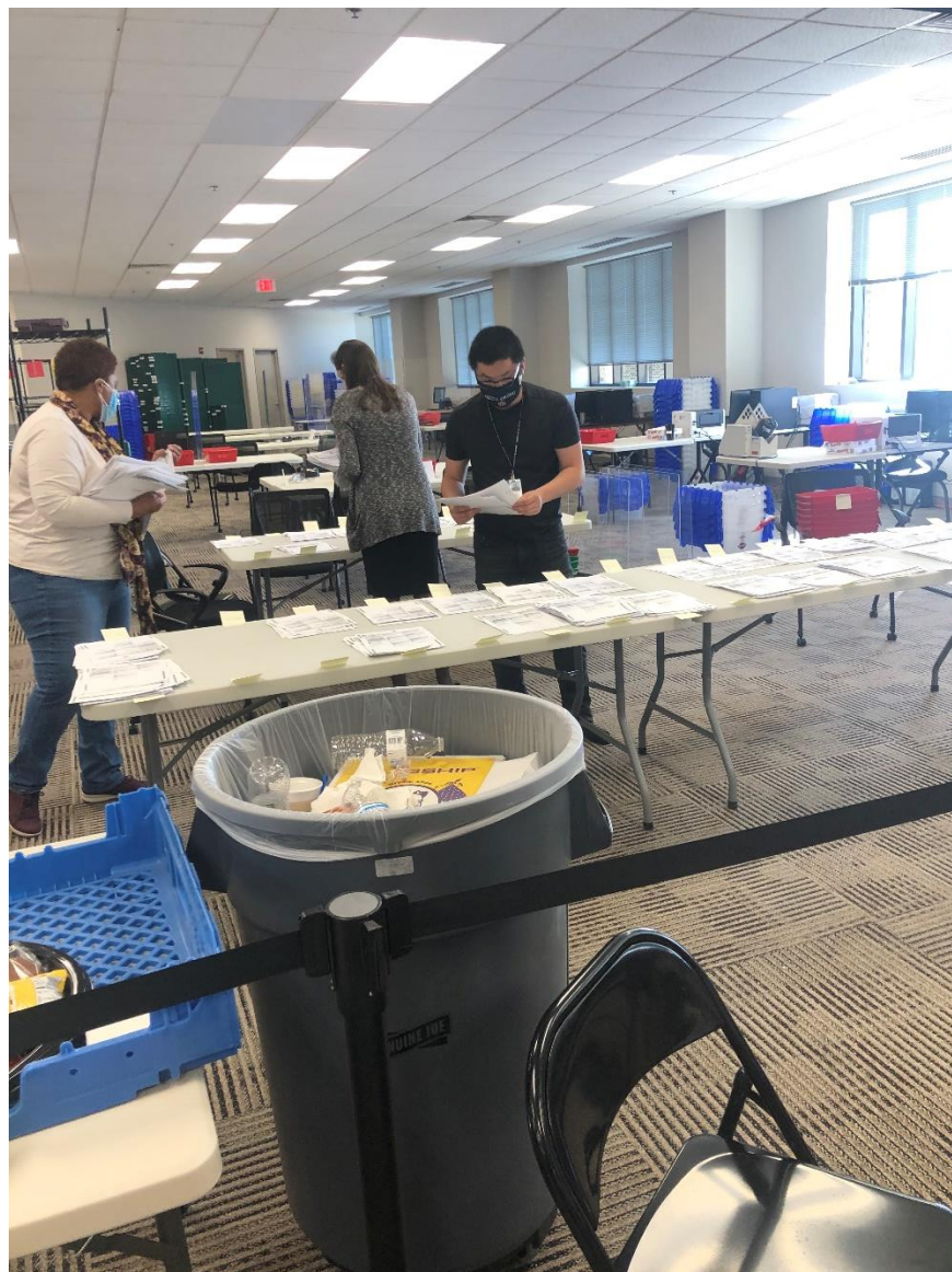
Figure 6 - Table with 4,500 opened ballots that would reportedly not scan being sorted and cured. Note approximate 10 foot distance from "observer" barrier

34. Just after the two racks with the 21 boxes of 500 unopened ballots each, I observed an open door to a 20'x30' storage room with dozens of semi opaque storage bins with blue folding tops that appeared to have envelopes in them. I could see through to another door that led back into the counting room which was the same door I had seen workers bring red bins full of "spoiled" ballots in the previous evening.