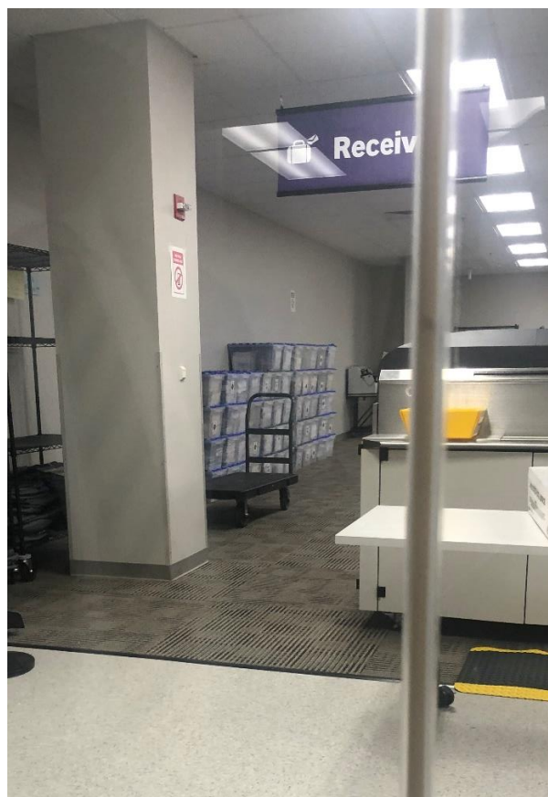
Figure 9 - Bins that had been moved from off limits "Office Space" storage room to another off limits area with what appeared to be envelopes inside to Receiving area near exit doors on Thursday evening - they were removed and gone shortly afterwards.

120,000 when myself and multiple others described herein had sighted anywhere from 20,000 to 60,000 unopened mail in ballots AFTER the 120,000 count had already been completed and updated on the http://DelcoPA.Gov/Vote website. I do not know where the 120,000 ballots went from the counting room after being counted, and was ignored by Ms. Hagan when I asked her where they were, and denied access to see them. At the end of the day on Thursday, I observed the opaque blue lidded plastic boxes stacked against the wall next to the BlueCrest sorter with what appeared to be mail-in voter envelopes but was not permitted to go near them and find out if they were opened and empty, or still sealed with ballots, or still had ballots in them, and they disappeared from the room shortly after I took the photo below.