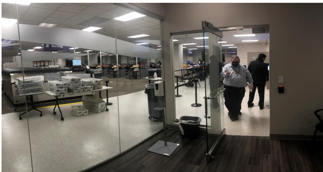
Figure 2 - Inner Entrance to DelCo Vote Counting Center - Note DelCo County employee approaching to stop photo