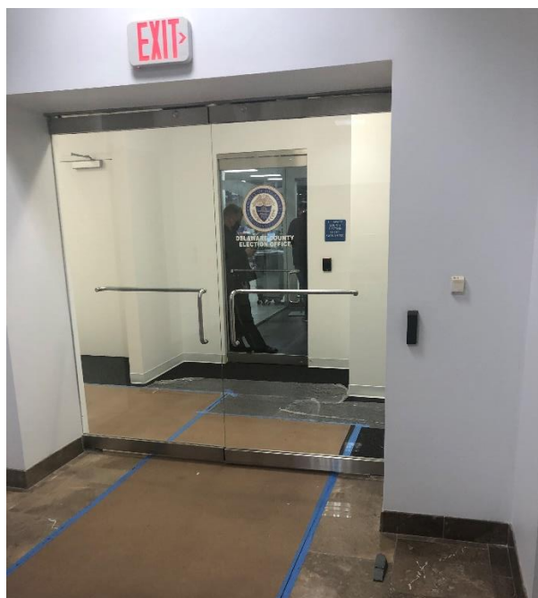
Figure 1 - Entrance to DelCo Vote Counting Center from 1st Floor Elevator bank

“no idea,” and “couldn’t see anything from behind the barriers.” I went back to the ground floor to figure out how to gain access and make calls.