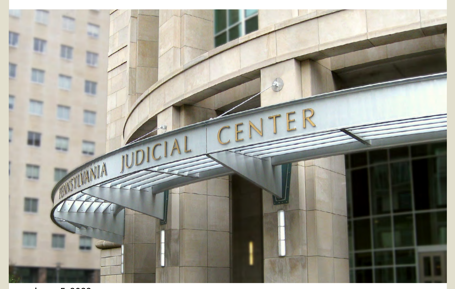
Issue 5, 2023