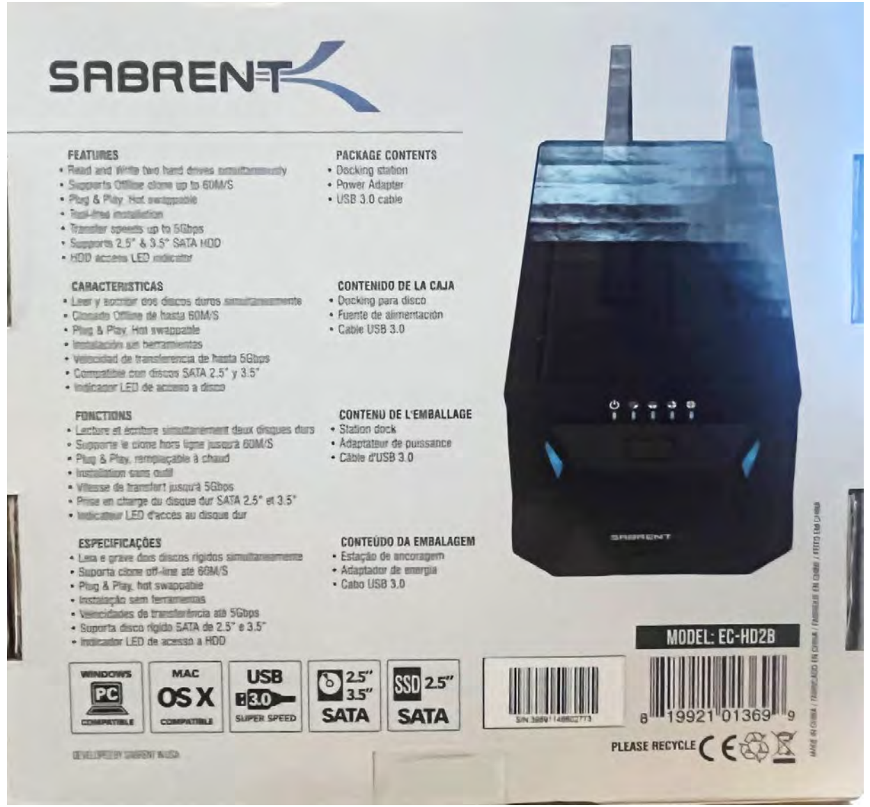
Figure 1-Back Cover SABRENT Packaging